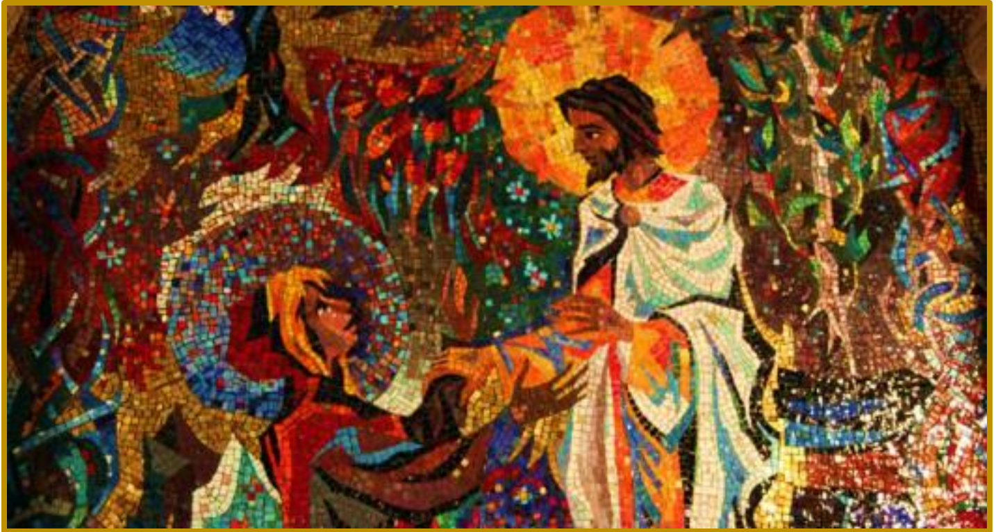
Mosaic in the Resurrection Chapel at Washington National Cathedral